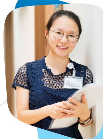
DAUGHTER OF A PATIENT UNDER TEAM-BASED CARE

Patients trust us more and it becomes easier for them to discuss their concerns and make decisions with us on how they want to manage their conditions. A big part of this is because the patient is matched to a team, and we can build a relationship with them over time.