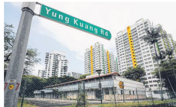
Left, below: The site of the upcoming polyclinic in Taman Jurong, which is bounded by Corporation Drive and Yung Kuang Road. It formerly housed West Point Hospital, a private medical facility that closed in 2018.