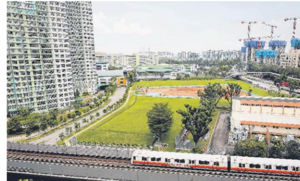
Left: The site earmarked for the redeveloped Clementi Polyclinic in Commonwealth Avenue West and Clementi Close.

"This is definitely one of the smaller-sized polyclinics in terms of floor area, but in terms of the